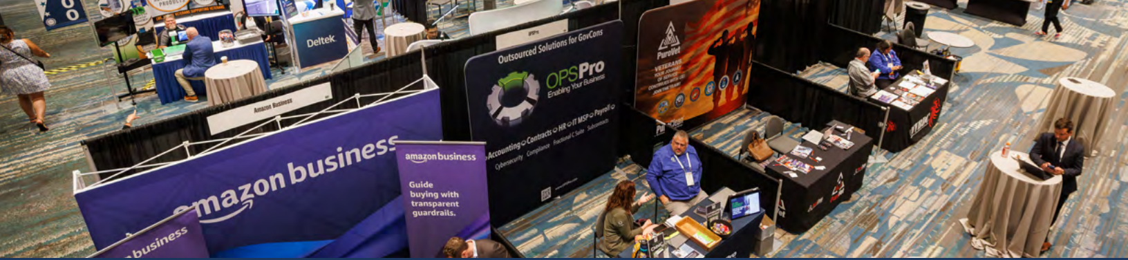
EXHIBIT FEES & BOOTH PACKAGES